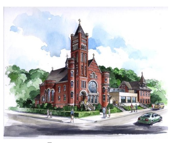
January 19, 2025 The Second Sunday in Ordinary Time

If you would like to have a MASS celebrated for the deceased members of your family, or friends, or for special intentions, please stop by or call the parish office.