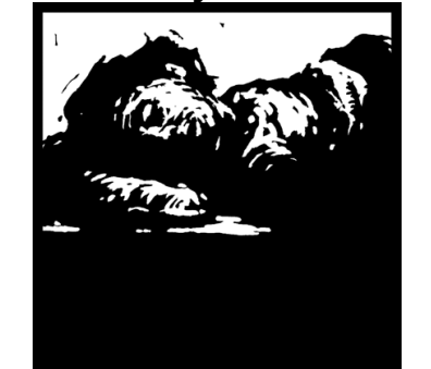
"Why this commotion and weeping?" - Mark 5:39